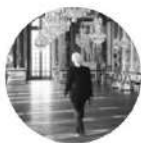
PARISIAN PARQUET FLOORING CHATEAU DE VERSAILLES