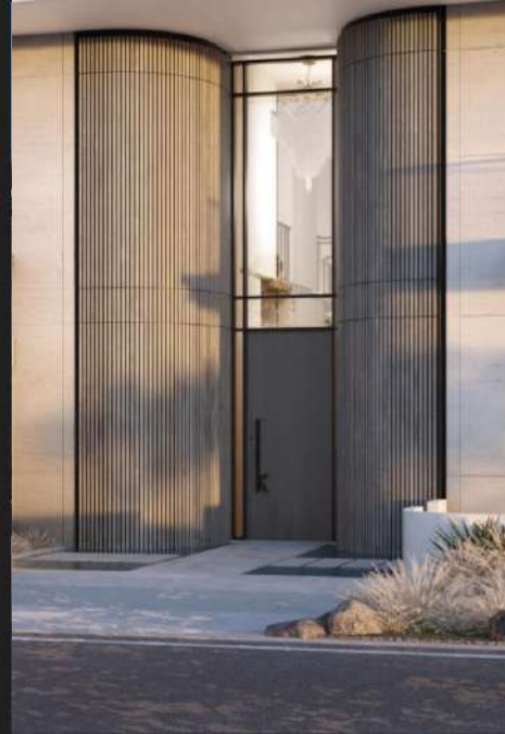
THE CELEBRATED RUNWAY