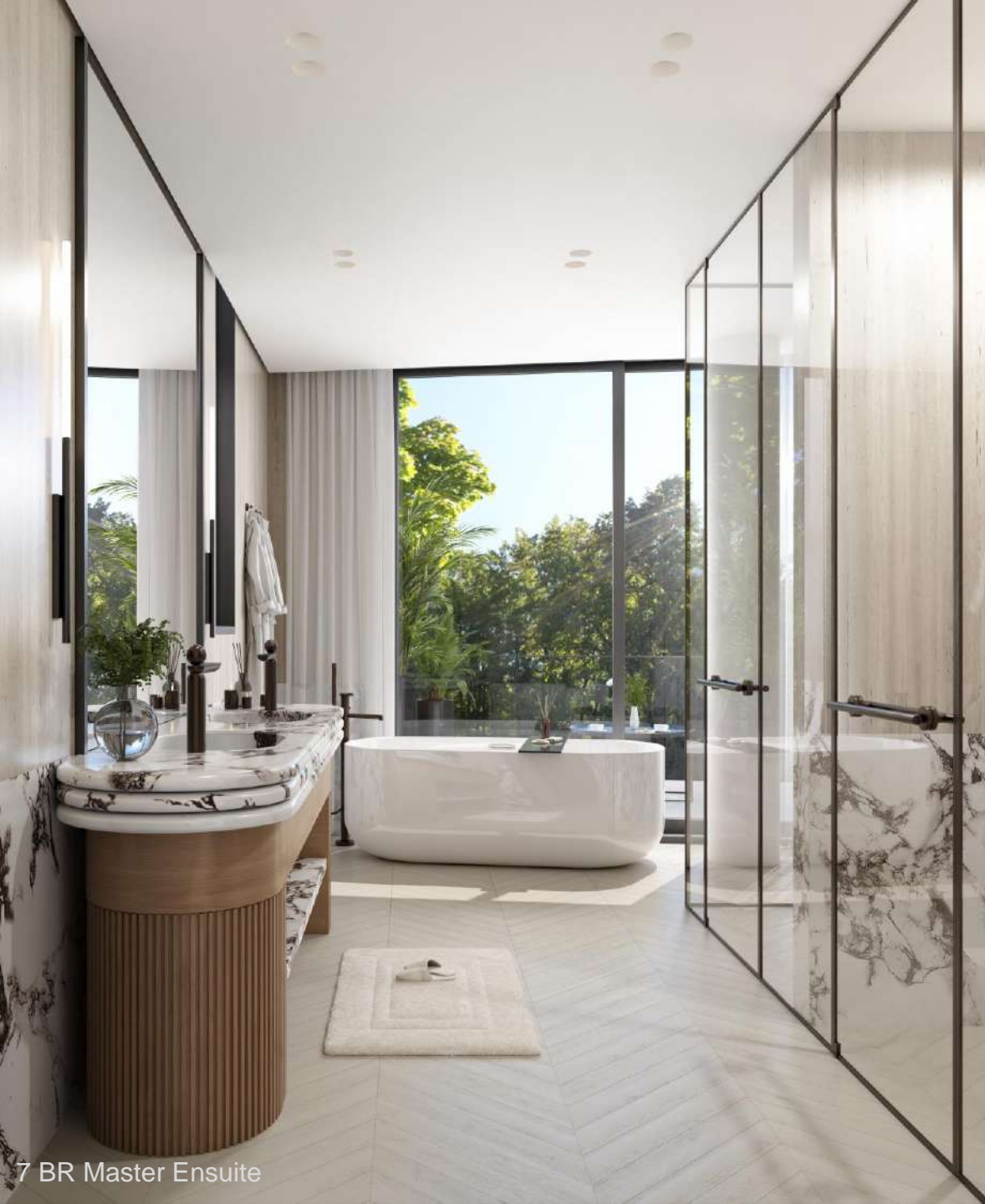
7 BR Master Ensuite