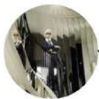
KARL'S FEATURE STAIR