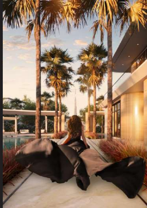
BRINGING NATURE INDOORS